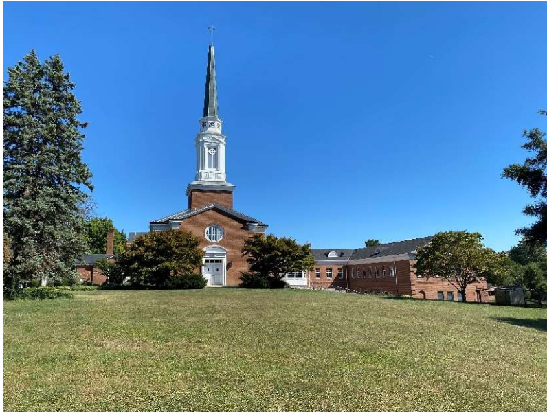
The fourth church with the CFC addition - 1994