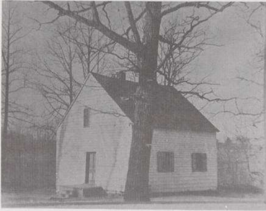
FIRST CHURCH 1822 - 1869 This photograph was taken in the late 1800's after the building became a public school.