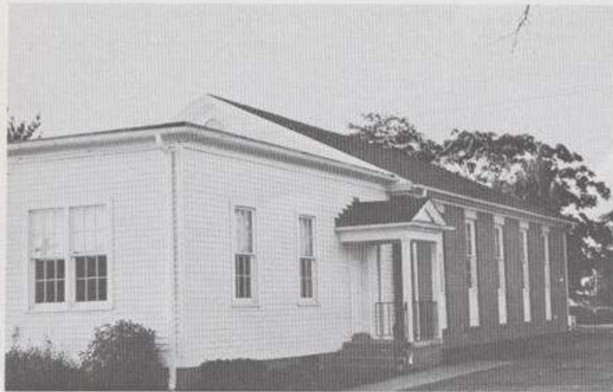
RESTORED EDUCATIONAL CENTER Dedicated May 5, 1968. The old church (1899), with later additions, was damaged by fire in 1967 and rebuilt.