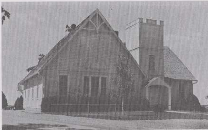
THIRD CHURCH (1899) WITH LATER ADDITIONS Became Educational Building in 1961 when fourth church was built.