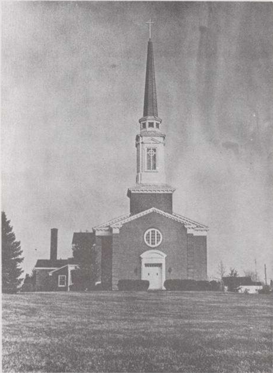
FOURTH CHURCH Built 1960-1961